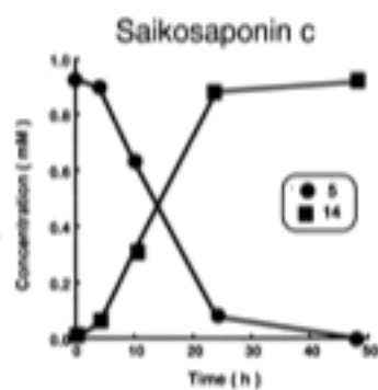
Fig. 1 Time course of metabolism of saikosaponin c ( 5 ) by a human fecal suspension.

Symbols : 5 , saikosaponin c ; 14 , saikogenin E. [Kida et al. , J. Trad. Med. , 14 , 34-40 (1997)]